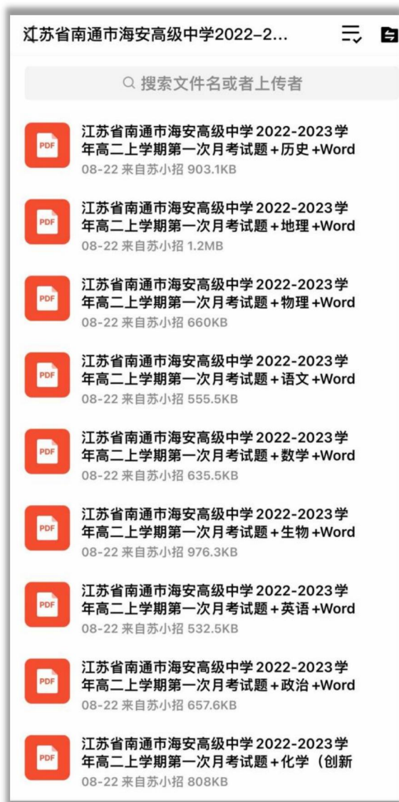
(招考网 qq 群资料)

如需第一时间获取相关资讯及备考指南，欢迎加入江苏招生考试网建立的【江苏高考交流群】，群内会分享一手高考资讯、往年真题、学习资料、综评、强基、志愿填报等干货及答疑，群内还有不定时福利发放哦，快加入吧！